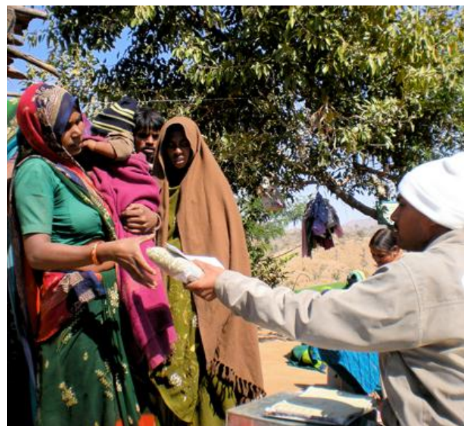
Parents collecting incentives for getting children immunized in Udaipur; co-PI: Esther Duflo (MIT)