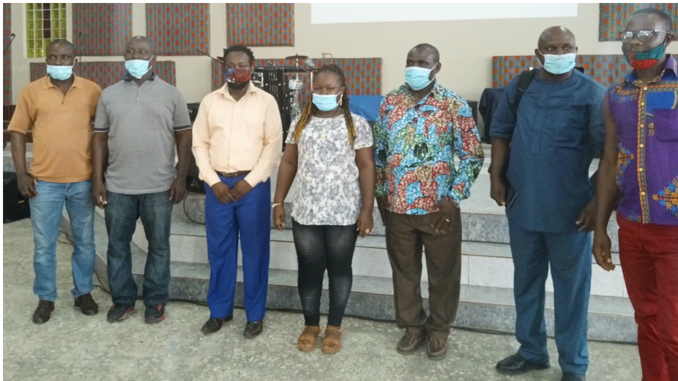
The Liberian Ministry of Education's National Learning Assessment System team with IPA staff during a COVID-19 safe field staff training.

This project was made possible due to the generous funding and support from the Global Partnership for Education.