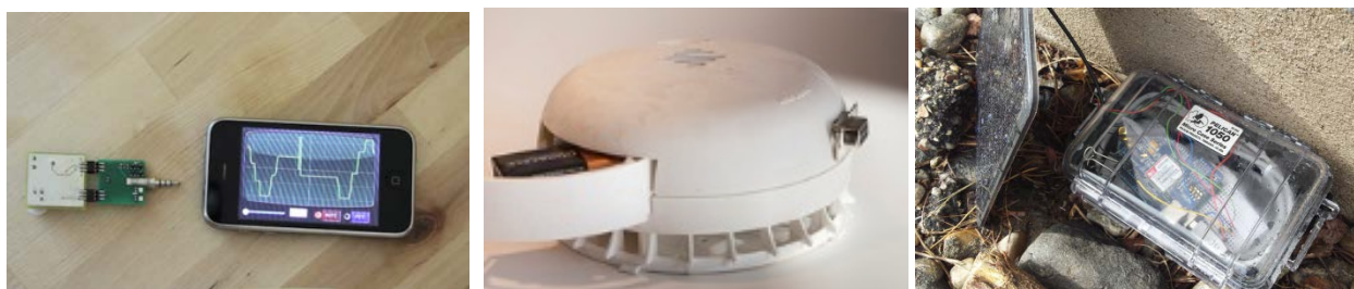
Figure 1. Three types of sensors (left to right): Add-on to cell phones (Project Hijack) 53 , Modified off-the-shelf (UCB-PATS) 54 , and purpose built standalone using existing circuit boards (solar-powered water sensor). 55

Purpose-built sensors are integrated platforms built from scratch using electronic components. Compared to modified off-the-shelf, these sensors can be designed for minimal end-user interaction and ease of remote control (e.g. through Wi-Fi or cellular networks). They can also be designed to have fewer maintenance requirements. They can be engineered to last up to 24 months in the field on a single pair of batteries – sometimes longer, when harvesting power through solar panels or other means. 52 However, custom-built sensors can be difficult to manufacture at scale, and the scale-up itself can be costly. They also require longer timelines to allow for prototyping, field piloting, and iterative redesign.